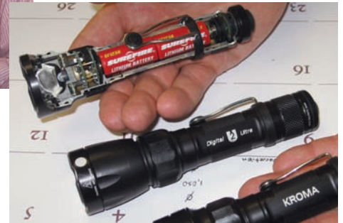
A cutaway of the SureFire K2 Kroma (top) reveals the complex Parylene-coated circuit assembly. Also pictured is a SureFire U2 Digital Ultra.

inspection, cleaning, masking, fixturing and coating, followed by 100% QPL inspection of coated parts. SureFire then conducts its own confirming QPL review on returned parts prior to moving them into production.